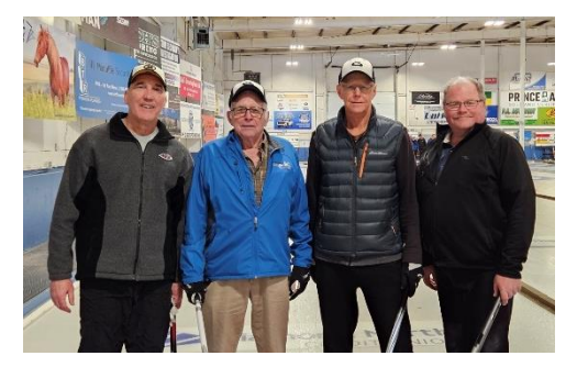
13 teams competed in the Senior Skins Spiel.